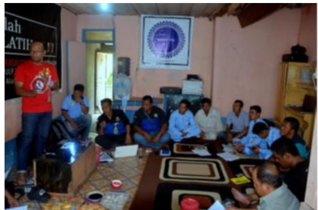
Darisman facilitated a discussion on strengthening the union with the coal-mining workers

LION's capacity on OHS issue and strengthen its capacity in supporting grass root movement in promoting OHS issue in Indonesia.