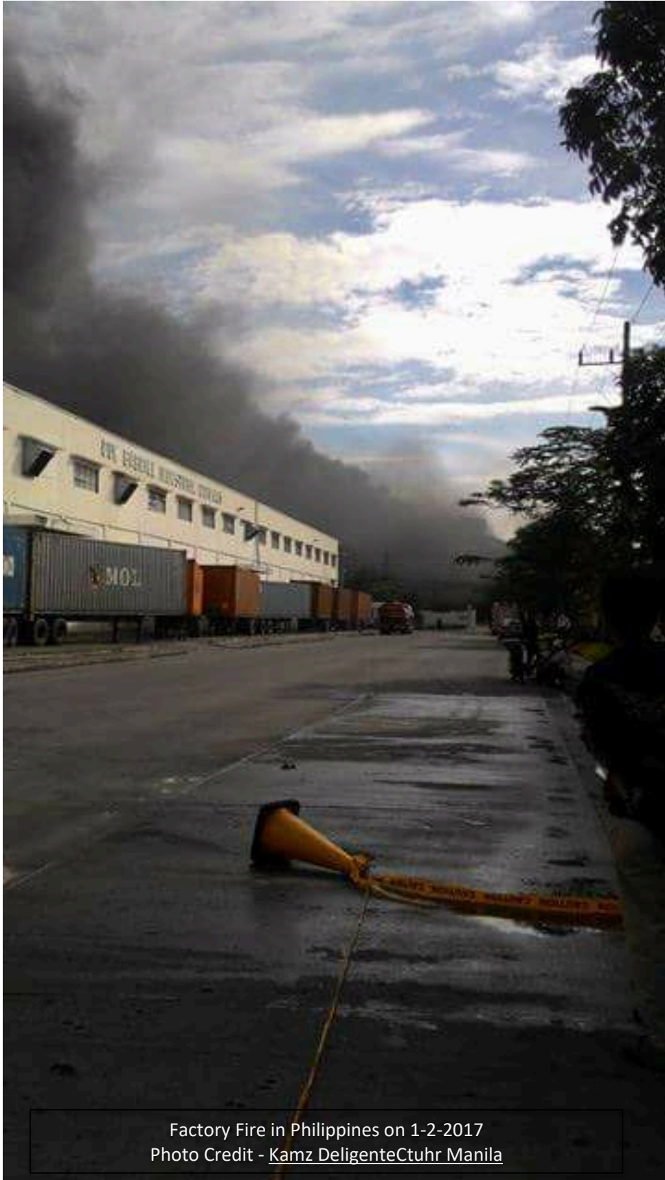
Factory Fire in Philippines on 1-2-2017